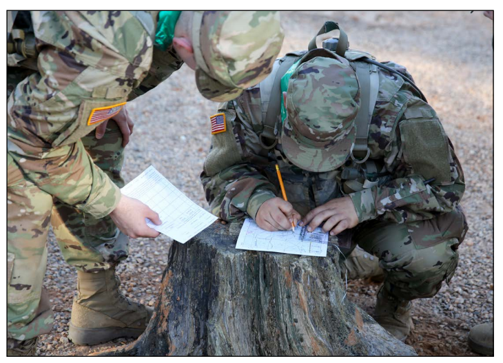
Soldiers in training with Bravo Company, 1-50th IN, complete a land navigation exercise on 13 February 2017 at Fort Benning.